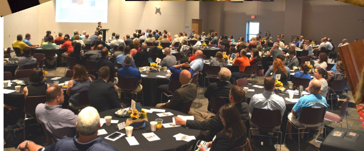
Hard Hat Breakfast - August 24, 2016