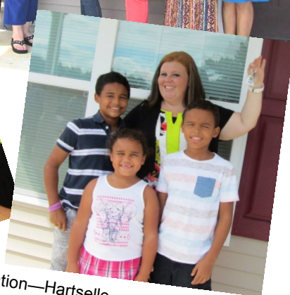
Summer Dedication—Hartselle Subdivision