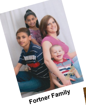
THESE FAMILIES DREAM OF HOMEOWNERSHIP... WILL YOU HELP?