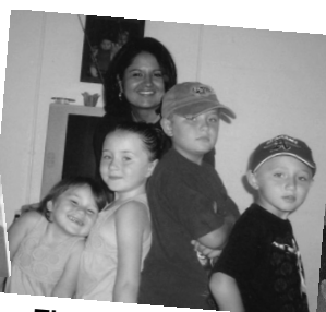
The Parker Family