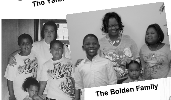
The Bolden Family