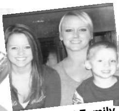
The Hood Family