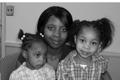
The Burt Family