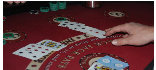
Big Deal