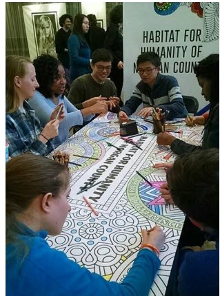
Color for a Cause, Decatur Mall, 3/13/18