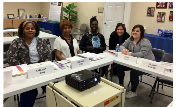
Homeowner Budgeting Class

CHANGE A LIFE! Simply fill out this form and return it in the enclosed envelope with your gift today.